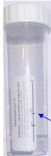
Buffer capacity test