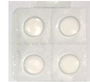
CO 2 tablet