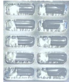
Paraffin capsules to collect the saliva sample