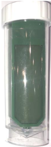
Bacterial detection for SM and LB